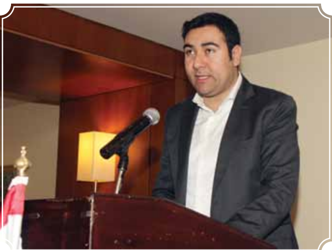
Representative of H.E. Minister of Social Affairs Mr. Ahmad Kassem (MOSA)