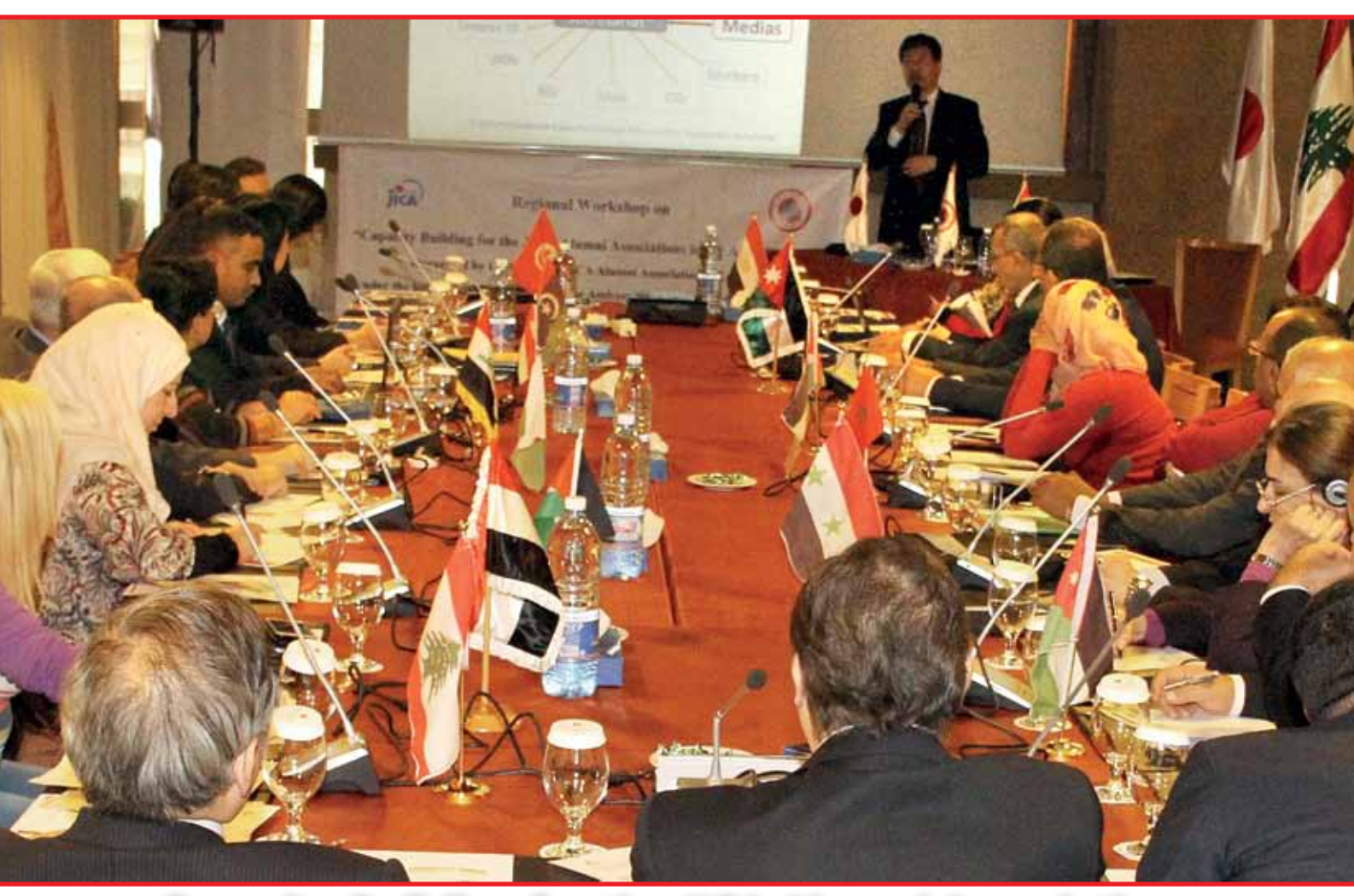
Capacity Building for the JICA Alumni Associations in the Arab Countries